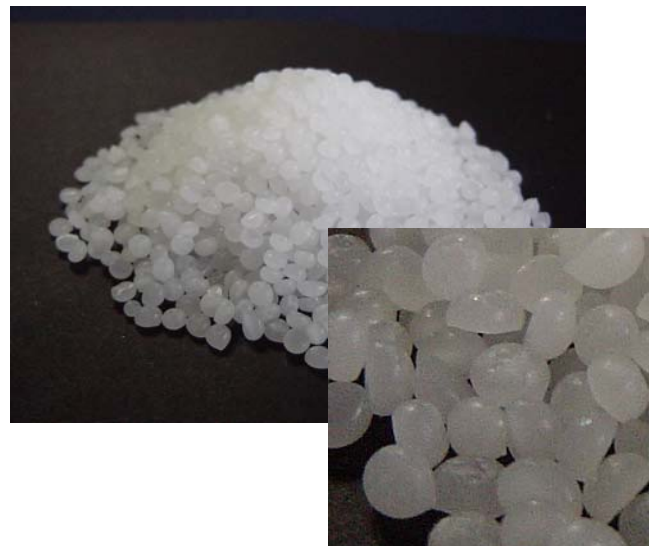
Antistatic Agent (NON-Dust)