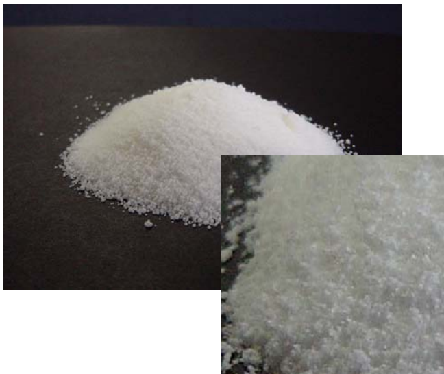
Other company Antistatic Agent (Dust)