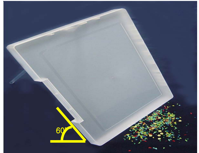
Without Antistatic Agent